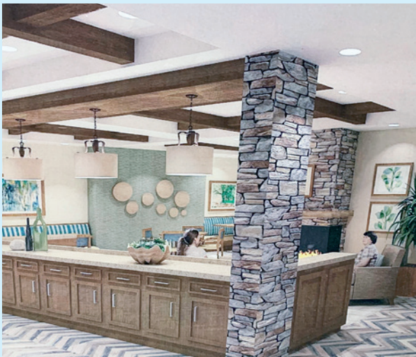
Artists rendering of Sunny View’s new social hub.

The new year will bring with it Sunny View’s newly remodeled lobby, concierge service and social hub. A new reception area will welcome guests while a concierge desk will assist residents with transportation, guest stays for loved ones, restaurant reservations and more. The comfortable social hub will be the perfect place to catch up on the day’s events with friends or just relax with cup of coffee or tea.