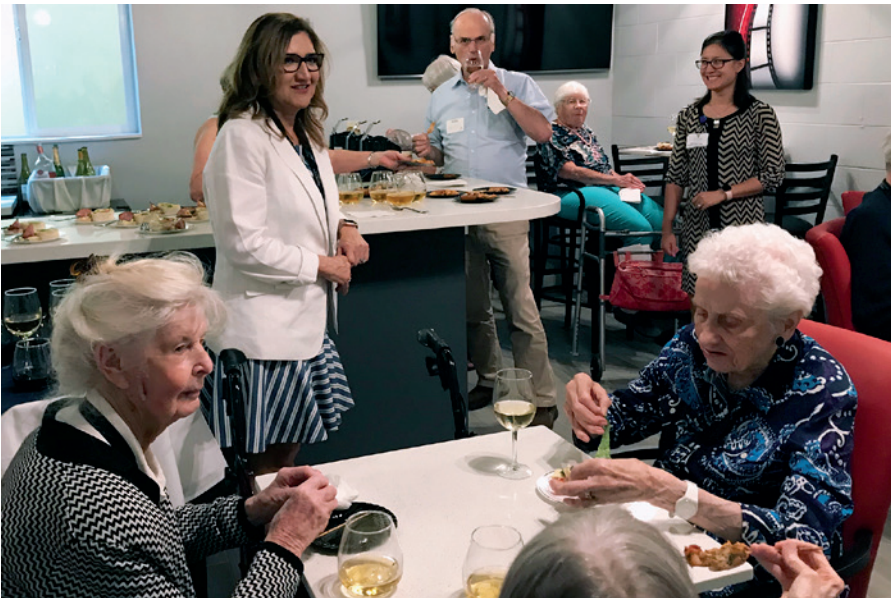
Residents and staff enjoy the Theater Lounge.

Themed in classic 1930s and 1940s theater motif, the Lounge features a service counter where residents can sit and enjoy snacks and their favorite beverages. Tables can be configured for individuals or small groups and a kitchenette provides space for pre-prepared food. Two 70-inch flat screen TVs can either mirror what is being shown in the adjacent theater or can be used independently to